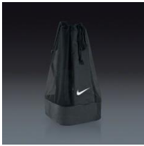
3 Nets: $89 each